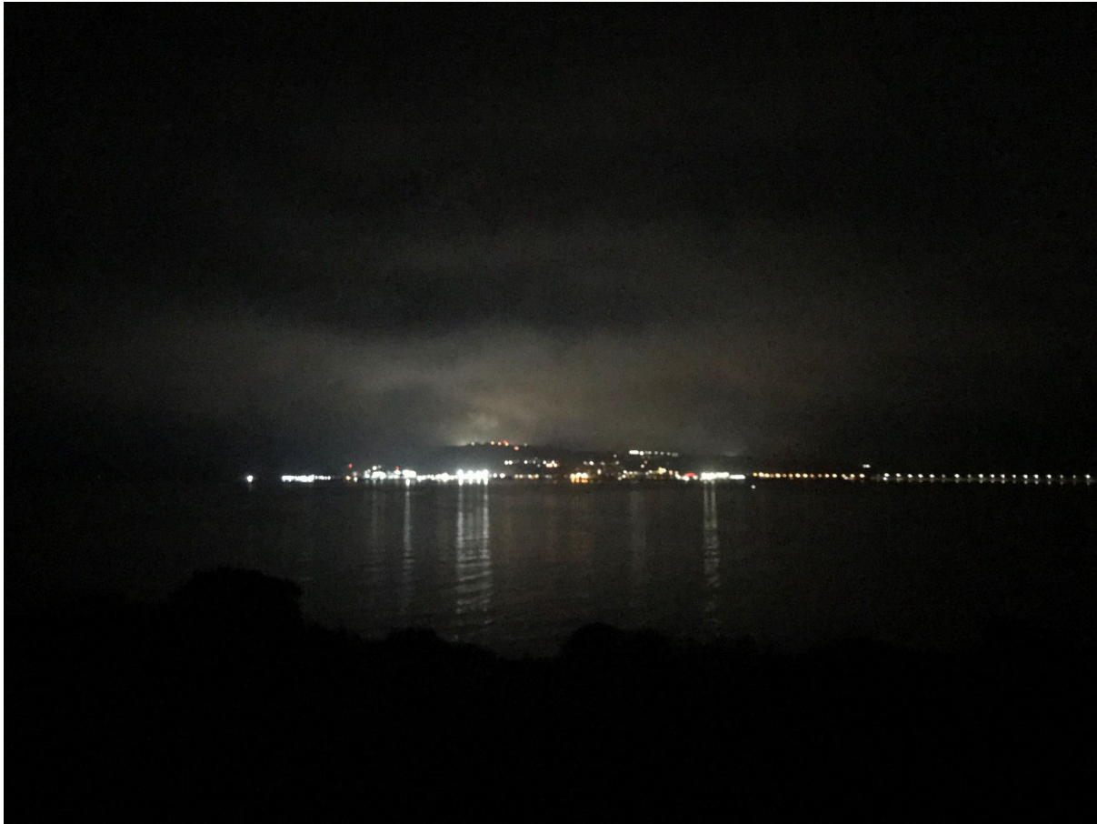
View from Sandsfoot Castle with the cloud cap capturing the street lights of Tophill and The Verne.