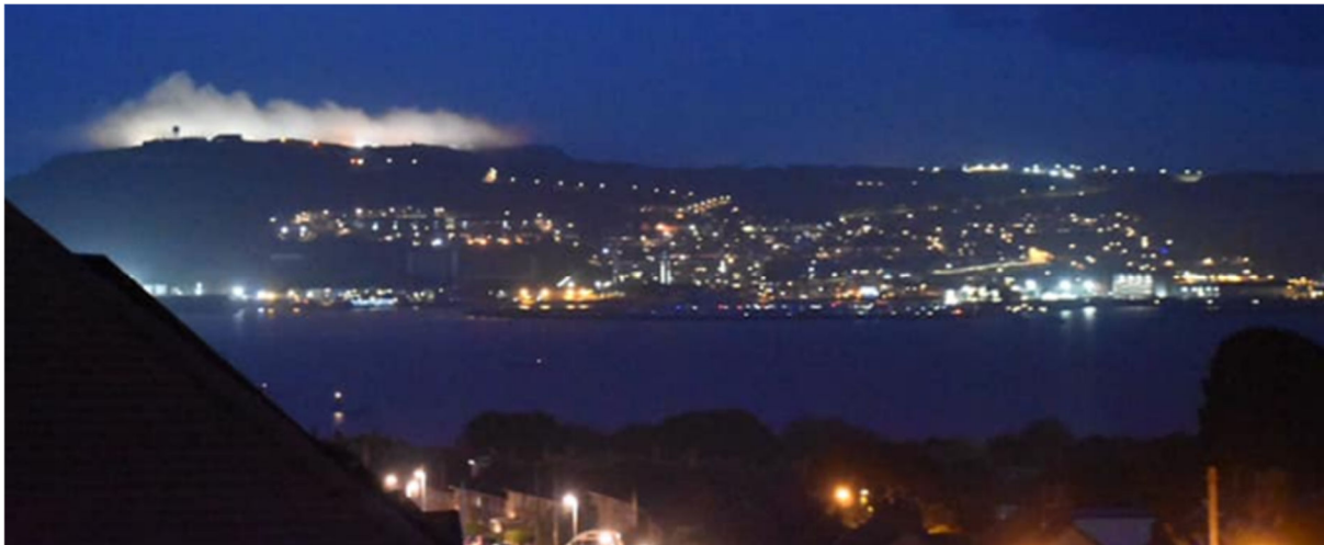
View from Rylands Lane Wyke.

All waste incinerators have plumes and at night this plume will be very noticeable. The Isle of Portland is the jewel on England's only natural World Heritage Coastline. The views from the mainland ridgeway are truly amazing and at night even more special.