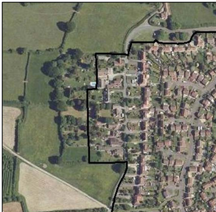
Figure 2: Exclusion of part of the rear gardens (settlement boundary in black)

field boundary/bottom of the gardens would be easily identifiable as a boundary, this does not outweigh the benefit of preventing development or a proliferation of domestic outbuildings that could lead to an undesirable sprawl of the village.