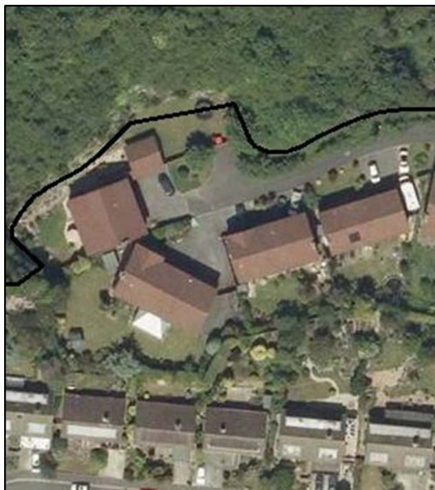
Figure 1: Cuts through garden (settlement boundary in black)