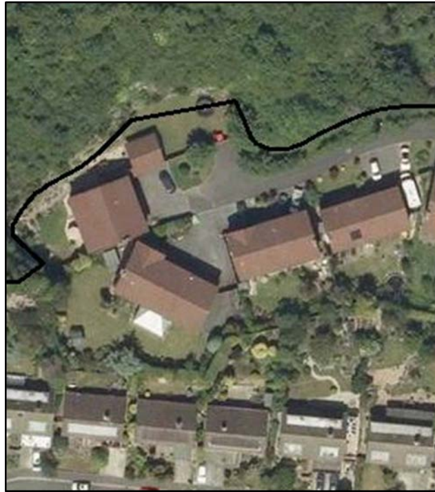
Figure 1: Cuts through garden (settlement boundary in black)