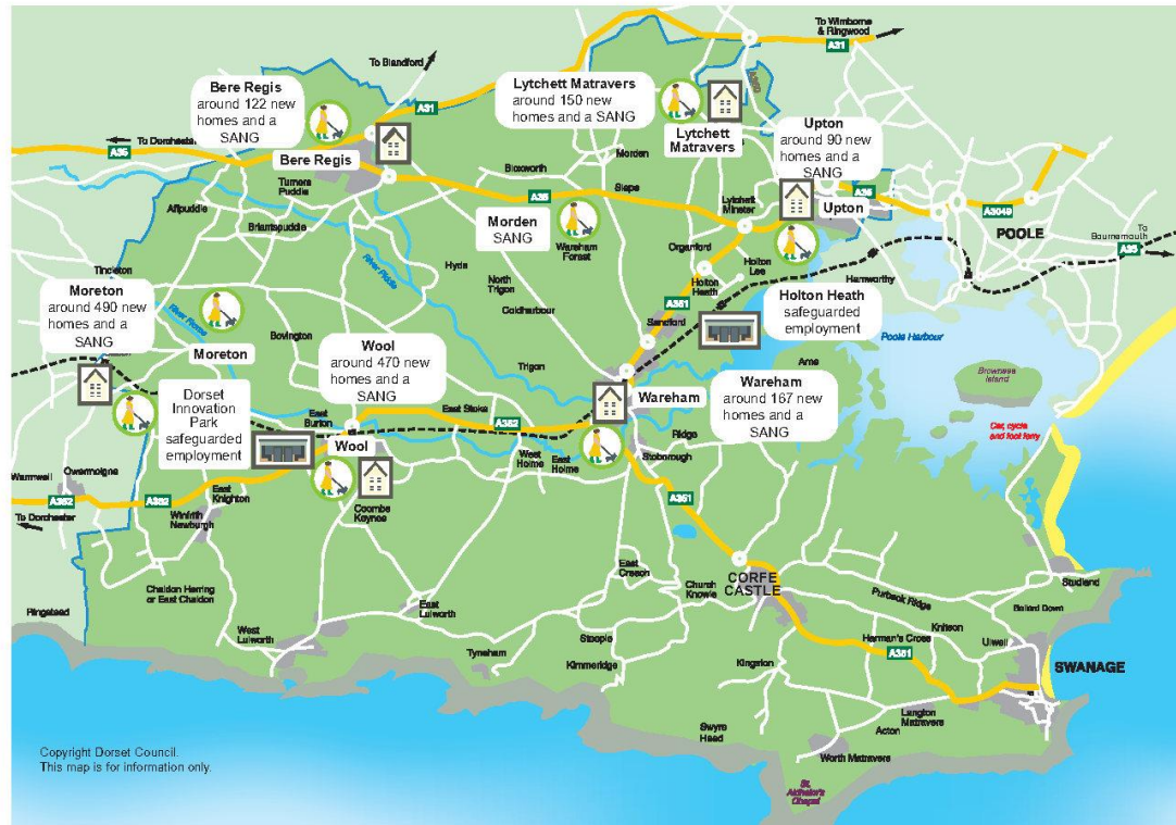
Key diagram: Purbeck's District Council's spatial strategy