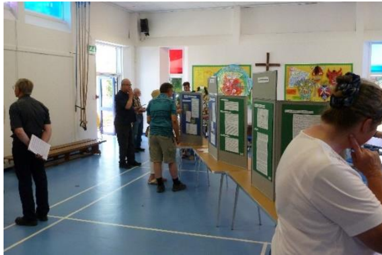
Call for Sites “Open Day” July 2018