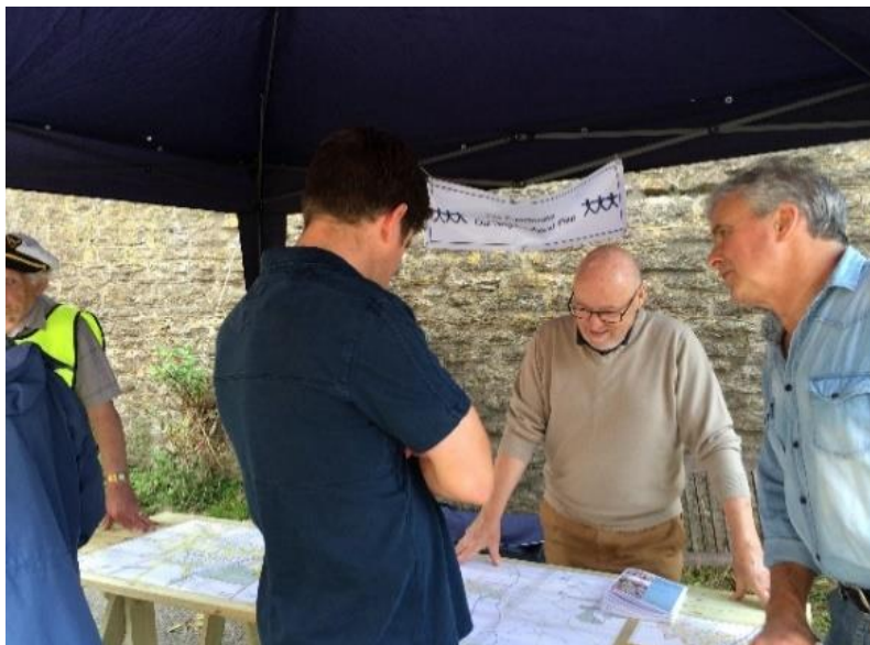
NP stand at the 2016 Yetminster Street Fair